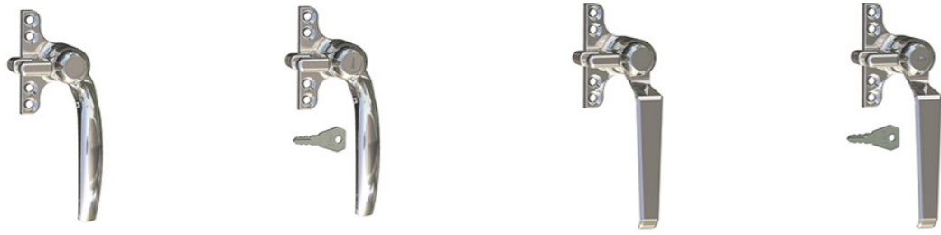
MHB Window handles