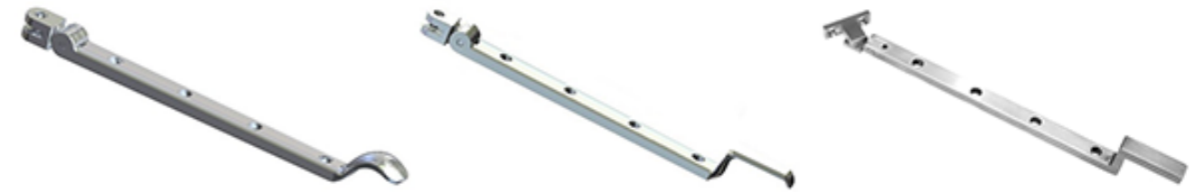
MHB Peg stay