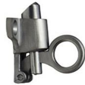
MHB Bottom & top hung window latch